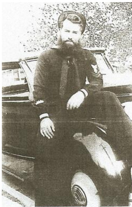
Final leave February 1943